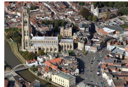
River Witham and St Botolph's Church