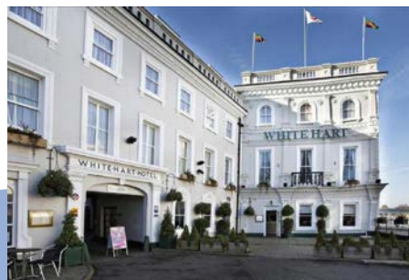
White Hart Hotel