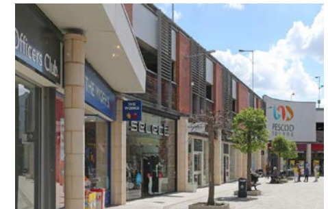
Pescod Square shopping