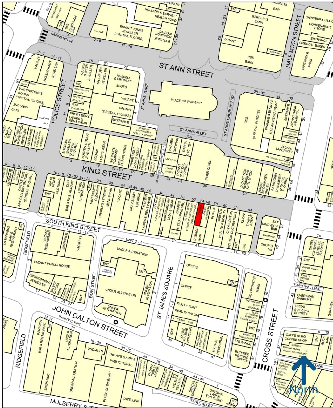
Experian Goad Plan Created: 17/12/2019 Created By: LTL Property Consultants Limited

LYONS THOMPSON LETTS PROPERTY CONSULTANTS